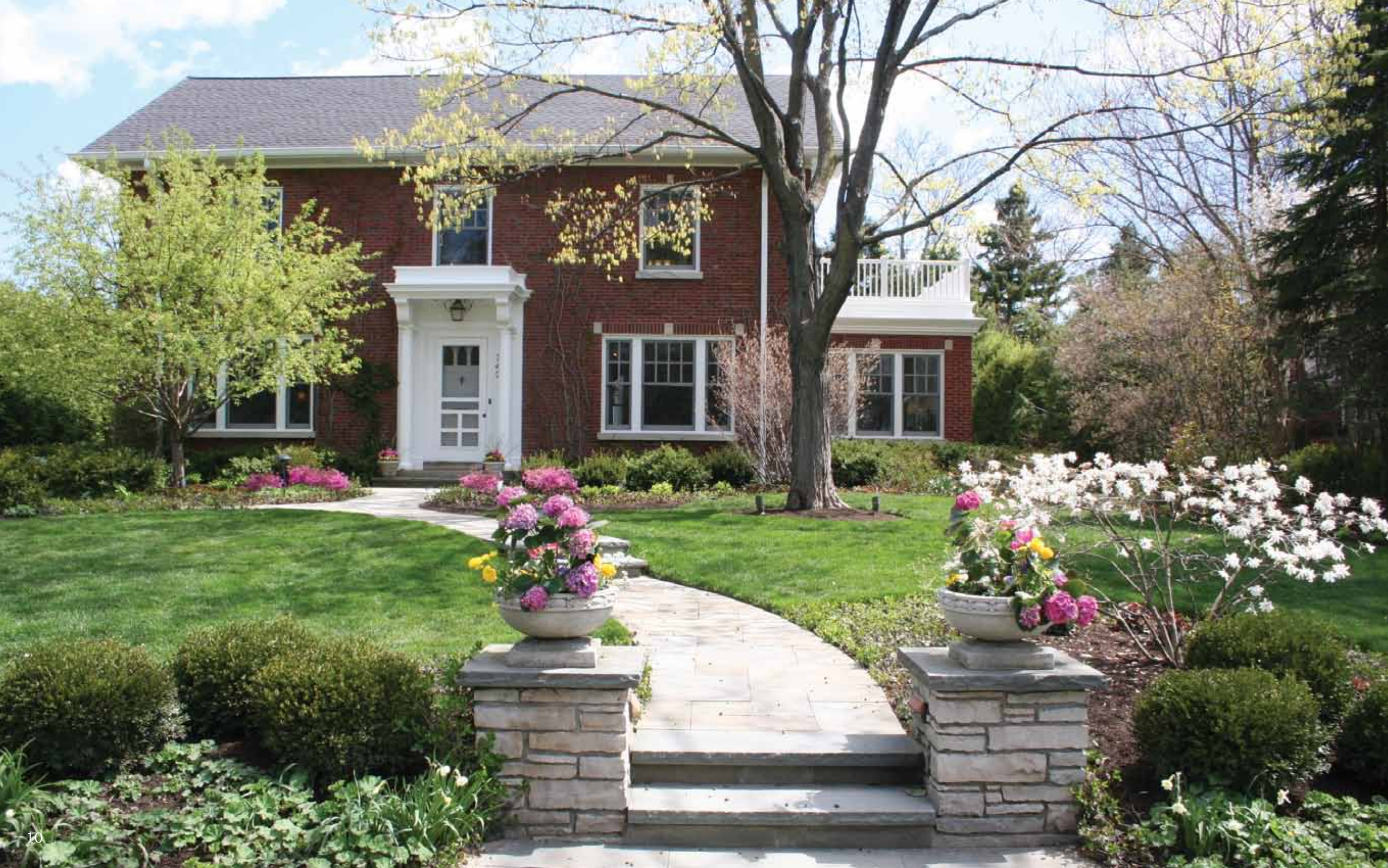
NLH Landscape Architects