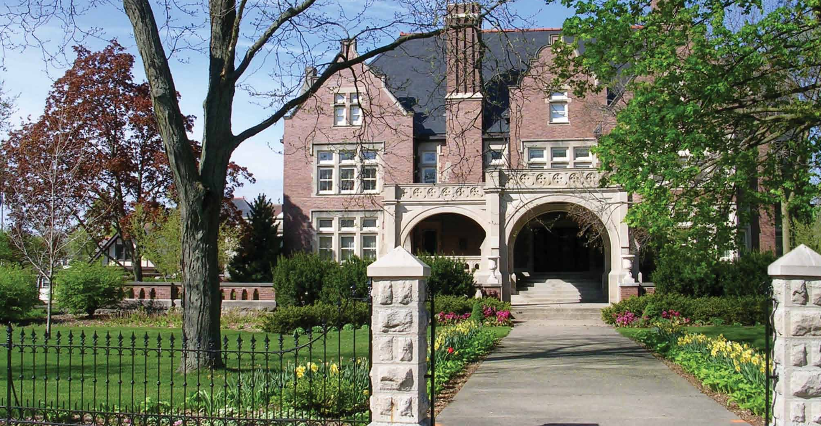
Schaefer Land Design