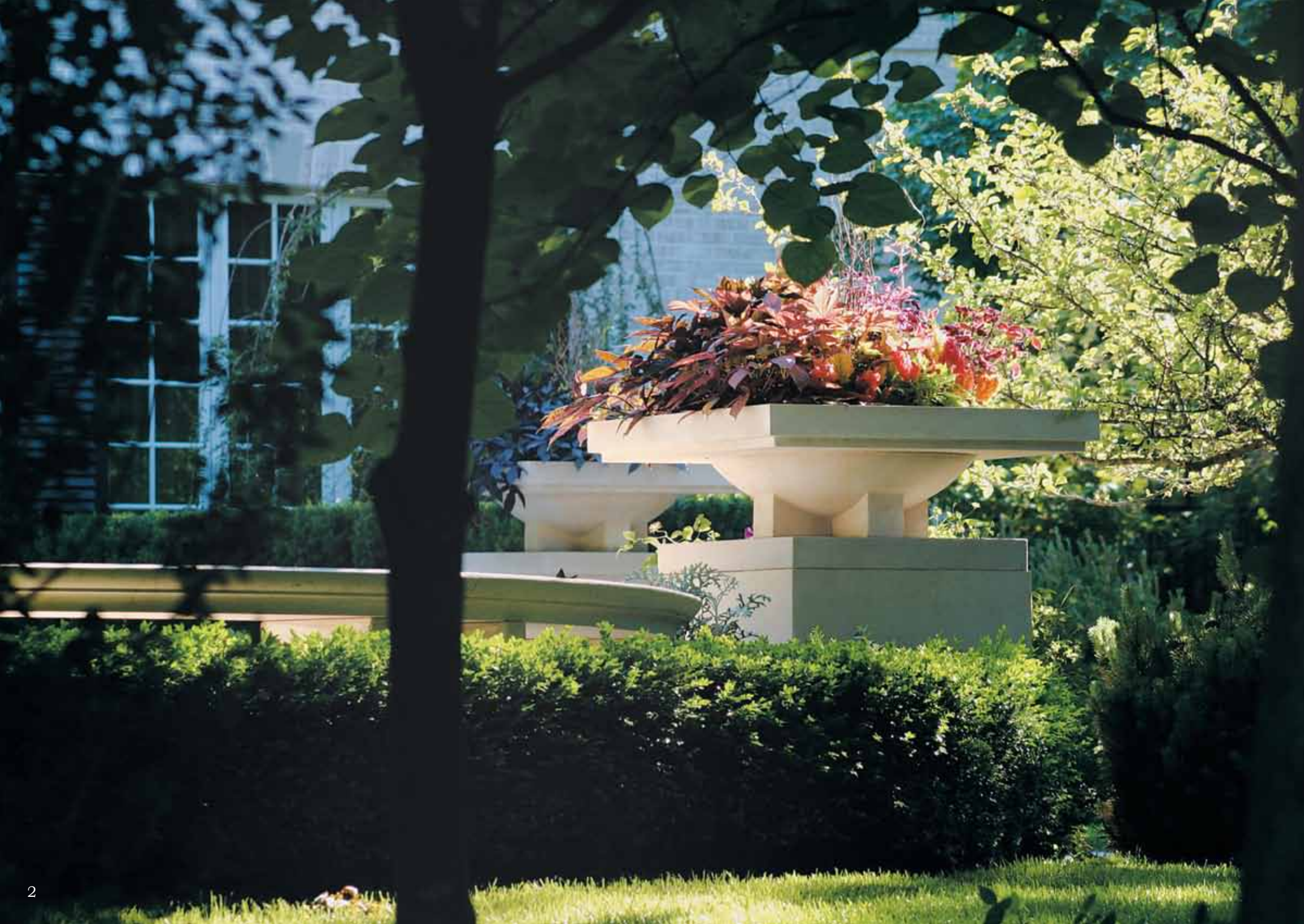
Ed Fried, Landscape Architect